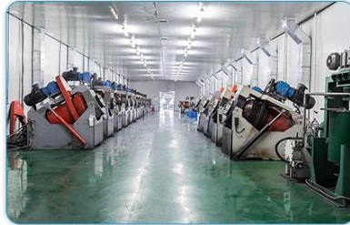
MIXING & GRINDING